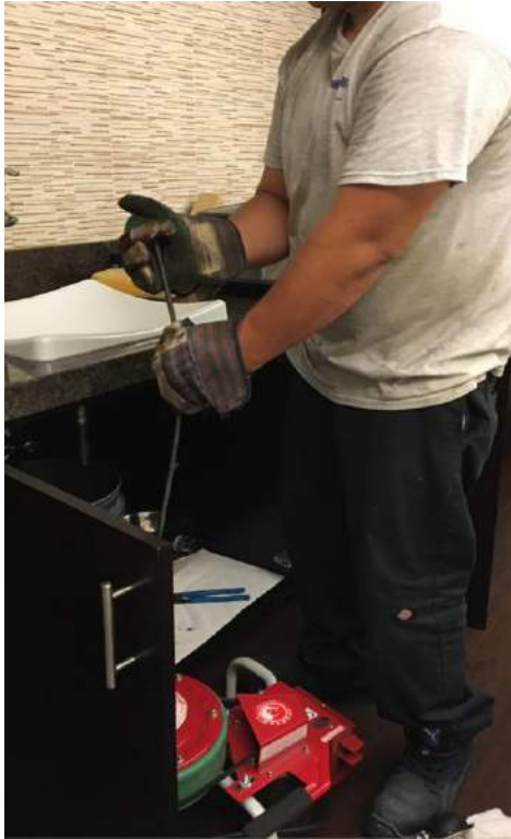
Lavatory sink being snaked.