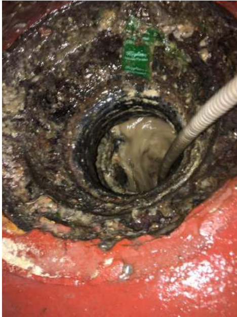
Floor Drain being snaked.