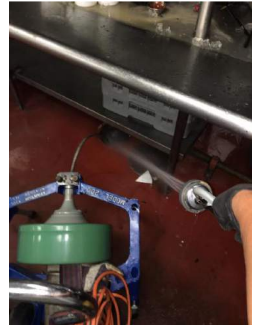
Backed up Floor Drain.

“If you have a Plumbing Problem you can Trust us to Fix it”