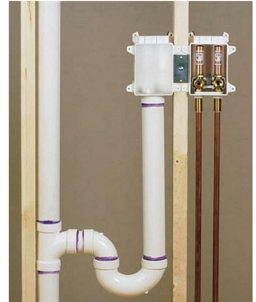
Laundry drain set up behind a wall.

"If you have a Plumbing Problem you can Trust us to Fix it"