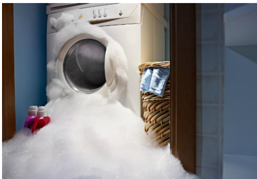
Laundry drain overflowing.